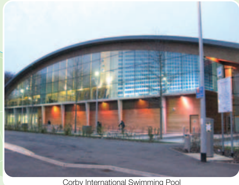
Corby International Swimming Pool