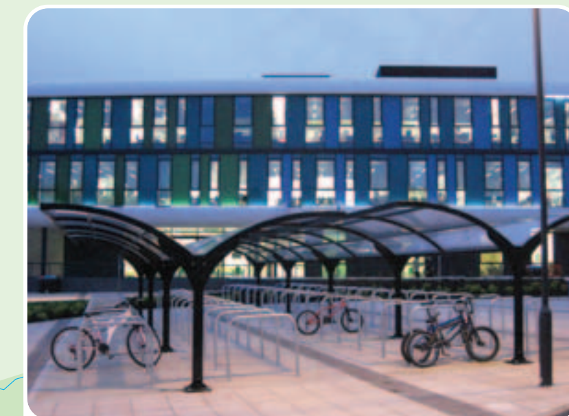
Tresham Institute cycle parking