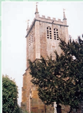
St. Mary the Virgin Church

The mainly 14th century church is reached via a steep climb from the green. The church was heavily restored in the 1880s. Interesting features include the clerestory windows, Victorian stained glass and the early 18th century altar rails.