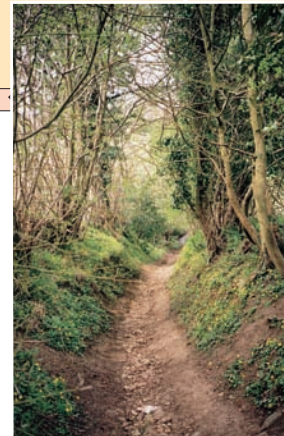
Badby Wood Walk

The only Youth Hostel in Northamptonshire, and the only thatched Youth Hostel in England, the stone and thatch building on Church Green was originally 3 separate 17th century cottages lived in by the Fawsley estate workers.