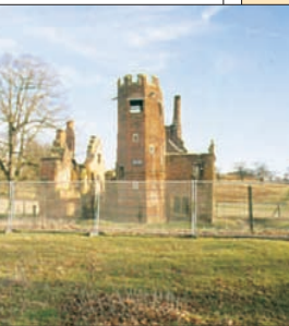
The Dower House