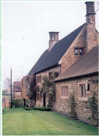
The Old House, Badby

The pretty stone village of Badby lies nestled among hills in a small valley - a collection of ironstone and thatch houses alongside the famous bluebell woods. The village has a long history with the first known reference to it dating from 944 AD, when 'Badden Byrig' was recorded in a Saxon land charter. By the time of Domesday, the manor had