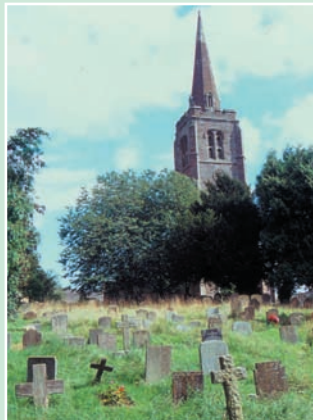
The Holy Cross Church - Byfield

Byfield is about 160m above sea level in the Northamptonshire uplands. It is thought to have been founded in Saxon times and its early name of Bivelde appears in the Domesday Book where it is recorded as consisting of 4 Manors. None of these exist now. It once had its own cattle and horse markets. It was on the railway line to Stratford on Avon and connections at nearby Woodford Halse meant that villagers could get to London in 2 hours. The railway went in the 1950s. The Parish burial ground is now situated on part of the station area. Many village houses are built in the local warm colour ironstone and have been given Listed Building status.