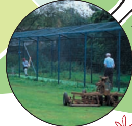
Practice nets at Byfield Cricket Ground