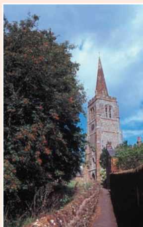
Holy Cross Church - Byfield

Leave the Village Hall car park and walk towards The Green. Turn left along New Terrace with the Cross Tree Public House on your left. Bear slightly left along Banbury Lane and turn right into Bell Lane. Pass the Old Bell Inn on your left. Turn right into Westhorpe Lane. Continue to the end turning right at the 'T' junction and very quickly right onto the footpath back towards the village. At a junction of footpaths turn right. This will bring you out onto Banbury Lane. Turn left and then right into the High Street. Continue until you come back to the car park. Keep the car park on your right and follow the footpath to the Church.