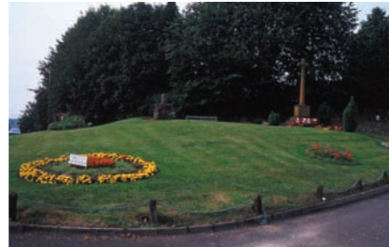
The War Memorial Garden - Byfield

This is a registered Village Green and was much larger, until the new High Street was built through it. It was used for common grazing.