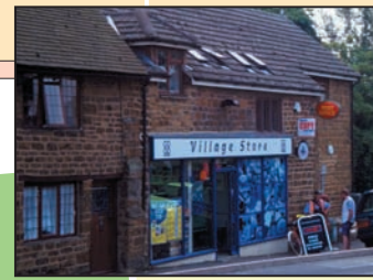
The Village Shop - Byfield