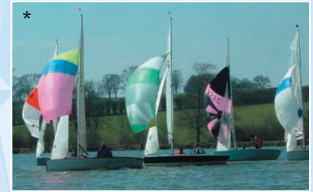
Banbury Sailing Club - Boddington Reservoir