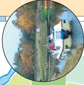
Boating on the River Nene