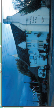
Black Horse Inn - Nassington