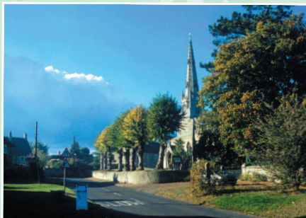
The Church of St Mary and All Saints - Nassington

Inside, the church contains some fine remains of early wall paintings.