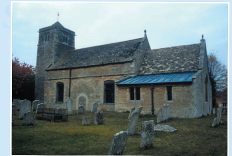
The Church of St Mary Magdalene - Yarwell

The church dates from the 13th Century. The building originally had north and south aisles but after a particularly heavy fall of snow and much rain in April 1782, the walls and roof of the aisles became unsafe. As the nave and chancel provided more than enough room to contain the inhabitants, the aisles with their porches were removed and the arcades walled up.