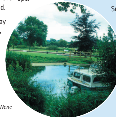
The River Nene

Admission to the house is restricted to specific days between the months of June and August.