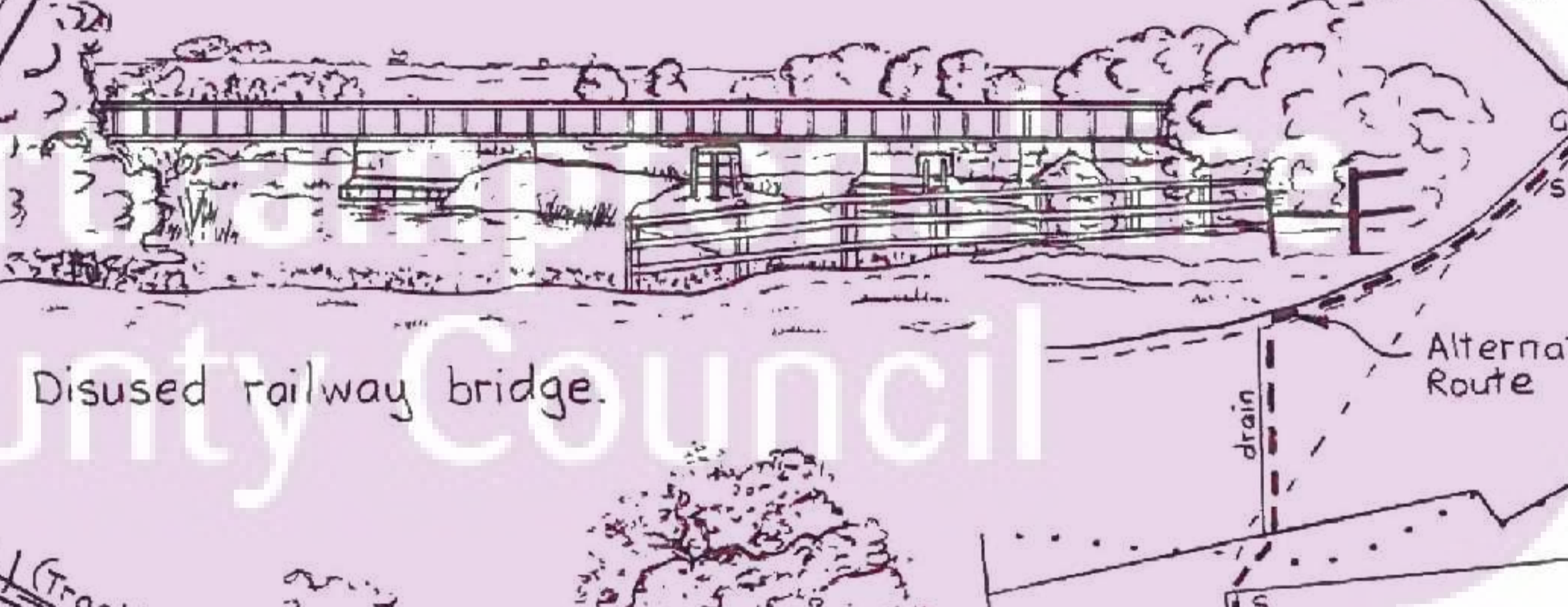
Disused railway bridge.

The terraced remains of the gardens of Lord St. John's Dower House can be seen close by Woodford Shrubbery. It was demolished in the early 19th century. (Scheduled Ancient Monument)