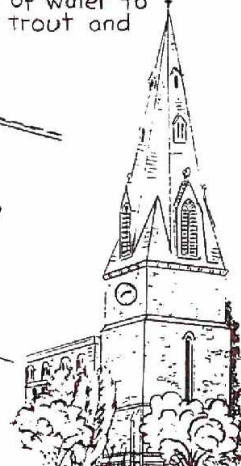
St. Mary - Ringstead

The building is plastered internally and the chancel has tall, fine windows with beautifully designed tracery.