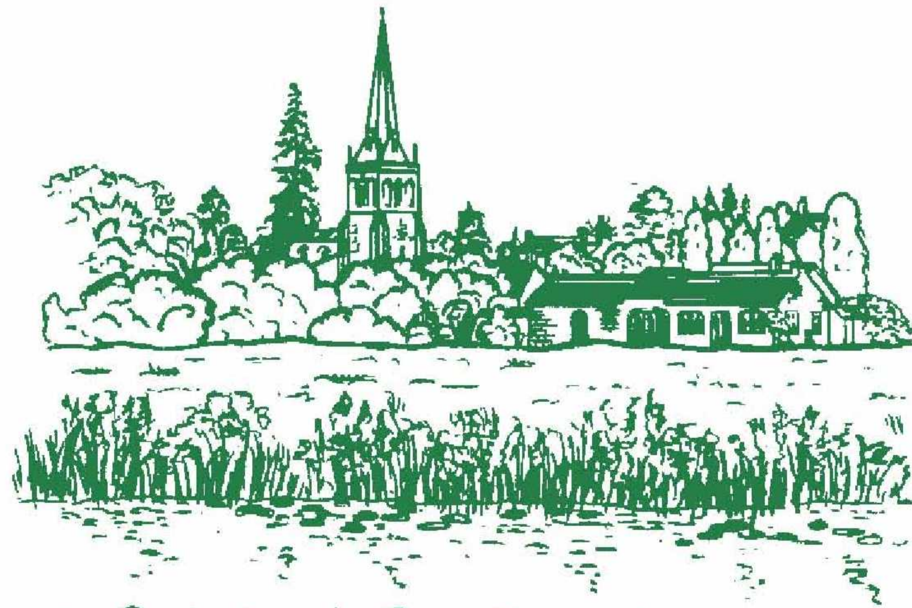
Denford Church from River Nene.

The gravestones have a particularly rich variety of lichens and mosses.