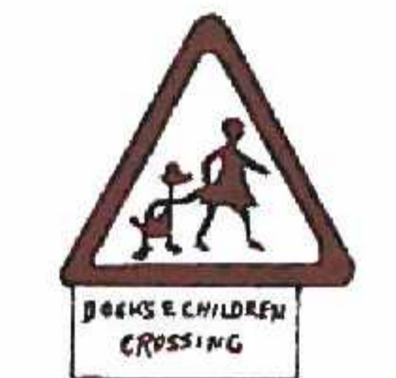
Traffic Sign - Denford

Aylesbury ducks are usually found in the water close to the road at Denford, hoping to be fed a crust of bread.