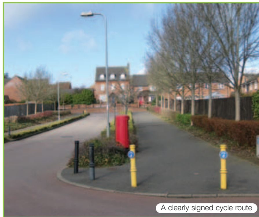
A clearly signed cycle route