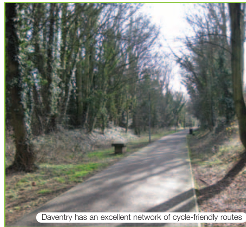
Daventry has an excellent network of cycle-friendly routes