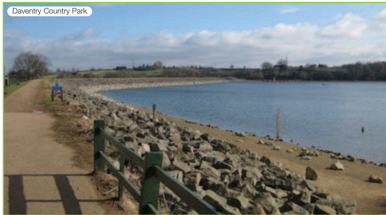
Daventry Country Park

tel: 08457 125678 web: www.eastmidlands.co.uk